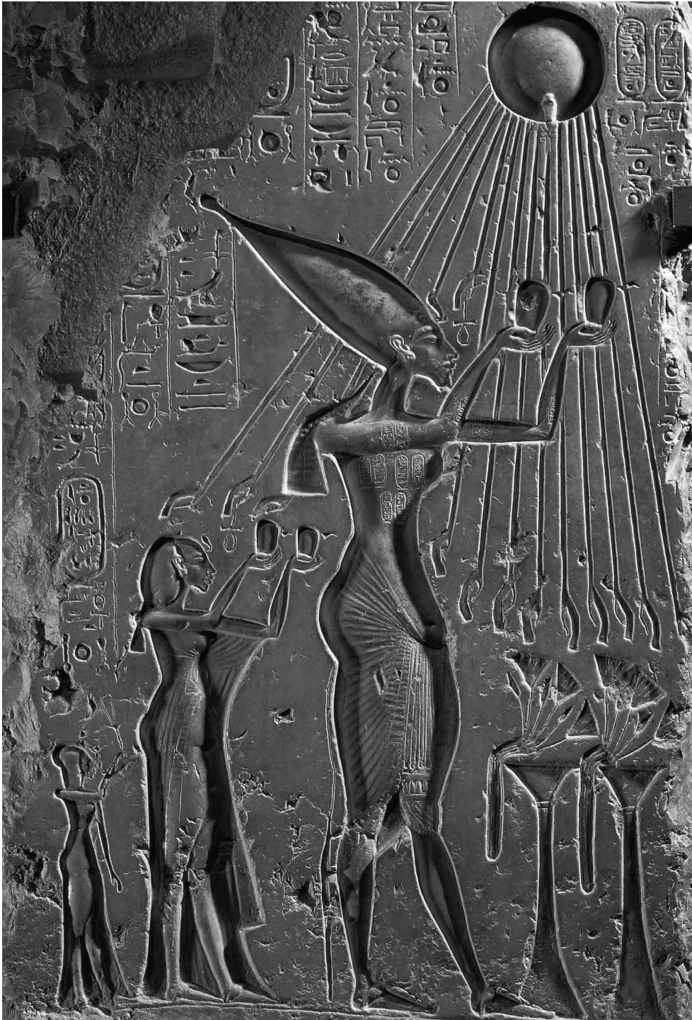
Fig. 1.2. King Akhenaten and Queen Nefertiti standing with offerings for the sun-god Aten. Relief from Amarna, Egypt, 1350 B.C.E. Egyptian Museum, Cairo.